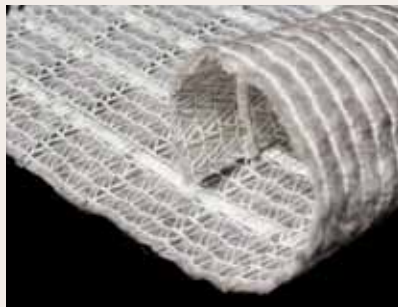
TenCate Polyfelt® PGMG.