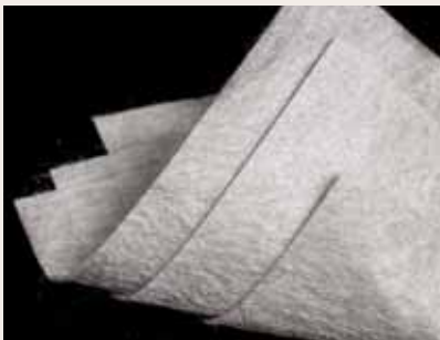
TenCate Polyfelt® PGM.

Polyfelt® PGM and PGMG are paving geotextiles specially manufactured for pavement rehabilitation to extend the life span of stressed pavements. Polyfelt® PGM is designed to provide optimum absorption of bitumen that effectively bonds the new asphalt overlay to the old pavement providing a waterproof layer within the pavement structure. It is suitable for applications on low to moderate trafficked roads. Polyfelt® PGMG is a pavement reinforcement composite utilizing fibreglass yarns and is ideal for use in airport runways, highways, container yards, cracked concrete pavements, and for cement-treated subbases.