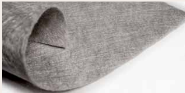
TenCate Polyfelt® TS & KET nonwoven geotextile.

A geotextile separator prevents the intermixing of two contrasting layers of material in road construction e.g. aggregate base course material and soft fine grained subgrade material. Without a geotextile separator the aggregates will punch into the soft subgrade; the net result being the compaction of the aggregates to achieve a target CBR value may not be achieved and additional base thickness is required to compensate for the loss of good aggregate into the subgrade. An effective geotextile separator also requires high permeability to allow rapid dissipation of excess pore pressures built up during transient wheel load passes. Polyfelt® nonwoven geotextiles are robust geotextile separators with high permeability to allow rapid dissipation of any excess pore pressures that built up during the course of construction and over the service life.