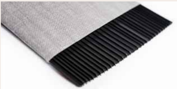
TenCate Polyfelt® AD.

TenCate has the capability to supply large quantities of Polyfelt® Alidrain PVD to fast-paced projects that require the delivery of the drains within a tight schedule. Its track record in high profile projects is a testament of its reliability to supply high quality and cost effective PVDs for soft soil consolidation projects.