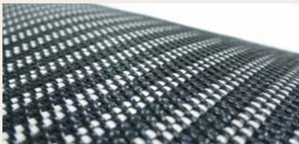
TenCate Mirafi® HPa geotextile.

Mirafi® HPa geotextile is an excellent product for pavement structures, combining all the critical functions that contribute towards subgrade stabilization. The use of Mirafi® HPa geotextile in a pavement design can save cost by allowing a reduced base course thickness to be adopted or alternatively extending the service life of the pavement. Mirafi® HPa geotextile is also a green solution. By allowing a thinner base course layer to be constructed, a pavement designed with Mirafi® HPa geotextile has a lower carbon footprint when compared with one designed with no inclusion.